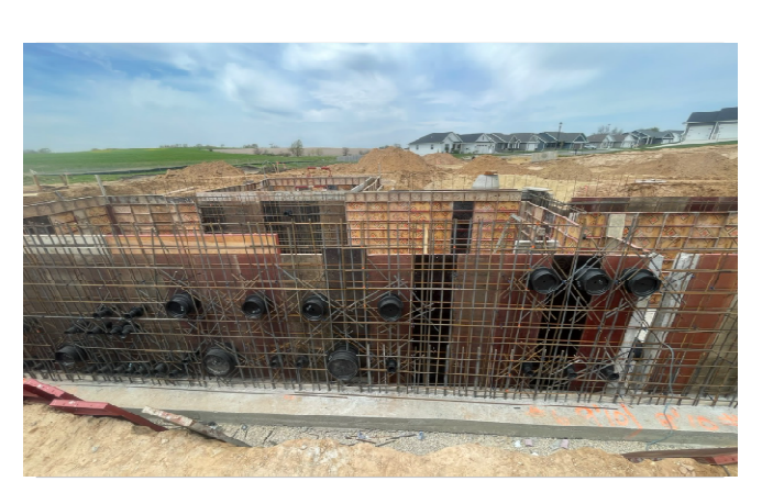
Wall sleeves set in equipment building South wall and rebar being installed