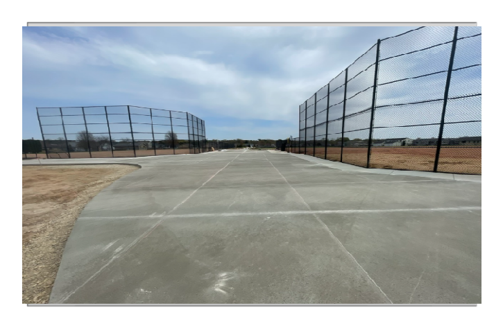
Concrete paving between ballfields