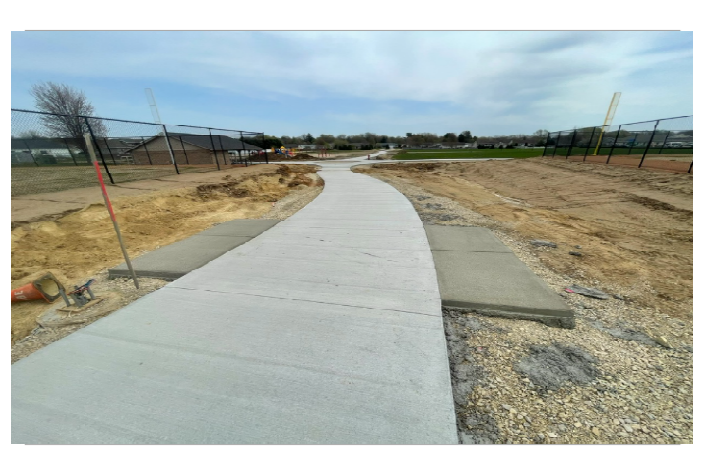
Bench pads poured