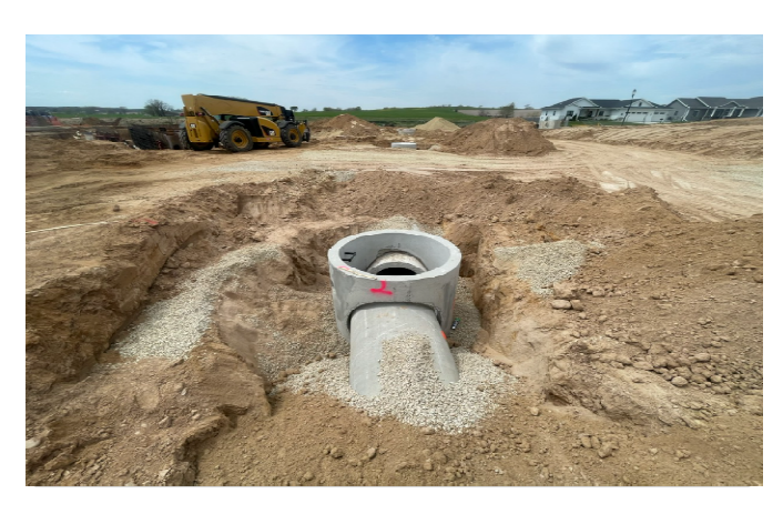
Storm pipe and structures being set