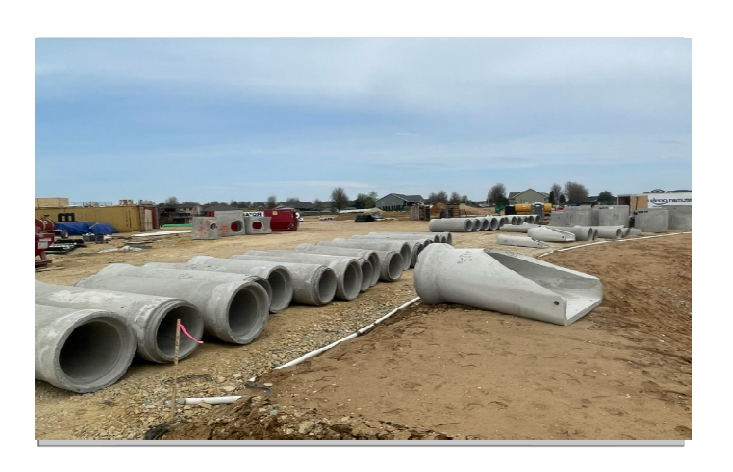
Storm RCP delivered and staged