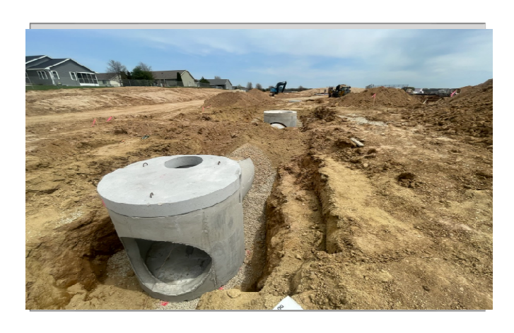
Storm run being set in North parking lot