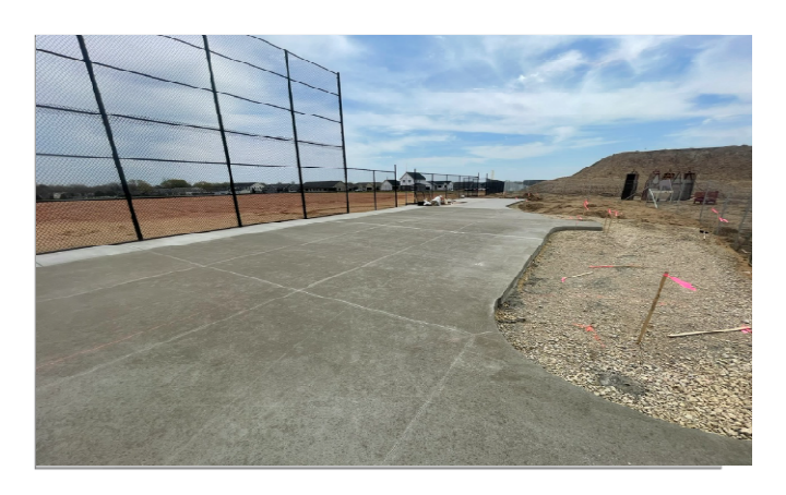
Concrete paving poured around baseball field