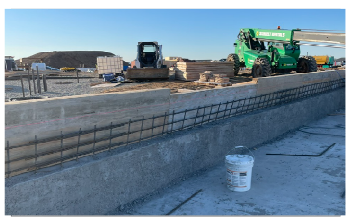
Lap pool gutter wall rebar being installed and forms set