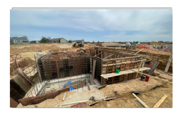
View of wall rebar and forms being set @ equipment building